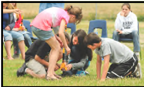
Sixth graders at Brouilett Elementary in South Hill, WA